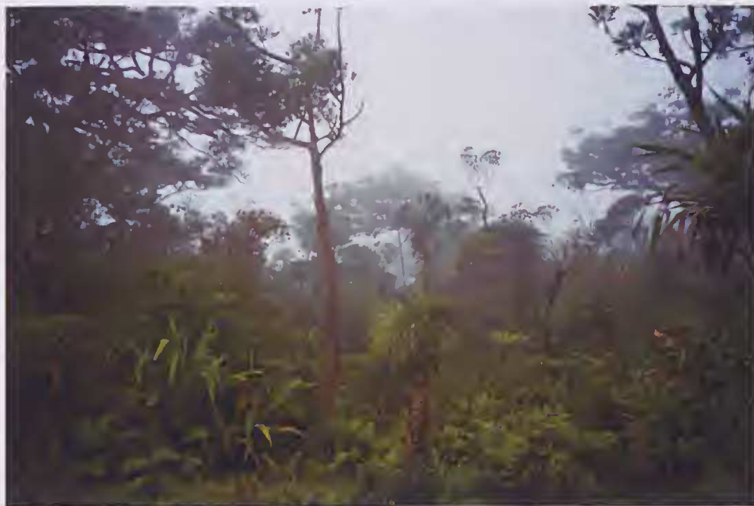
FIG. 4. Dense rainforest, locality of Taomica cassani gen. et sp. nov. paratype at 1,300m on the east face of Mt Panié. The area lies within a special botanical reserve.

DISTRIBUTION AND HABITAT. (Figs 1, 3-4) The main island of New Caledonia is elongate, about 400km long and 50km wide and oriented from the NW to SE in the SW Pacific Ocean. An irregular series of mountains runs the length of the island and these greatly affect rainfall patterns. South-easterly winds blow off the sea bringing rain which falls largely on the east coast and adjacent mountains. The western half of the island lies in the rainshadow of the mountains and receives very reduced rainfall. For this reason most rainforest lies on the eastern side